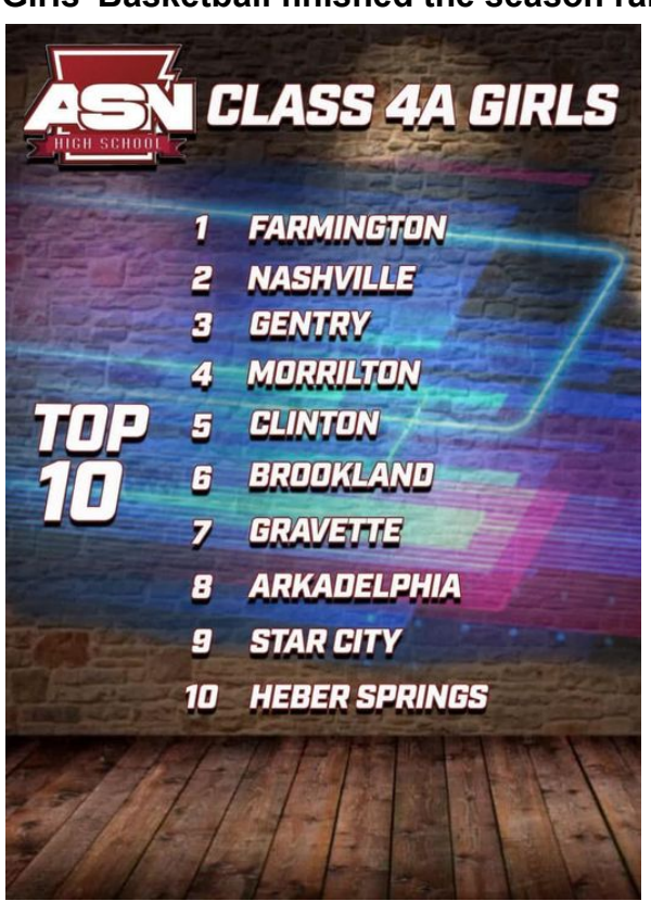
Girls' Basketball finished the season ranked #3 in the state