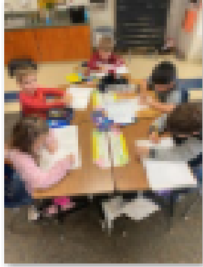
Bell to bell instruction!