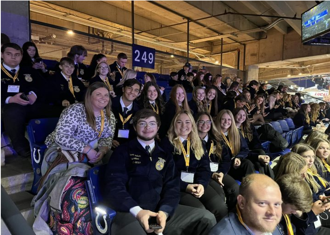
FFA competed at Nationals