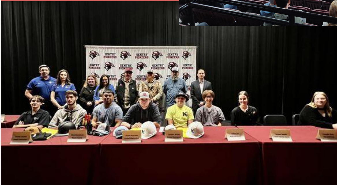
Lincoln Decision Day: top right Gentry: Left Huntsville: Top left Greenland: Bottom right